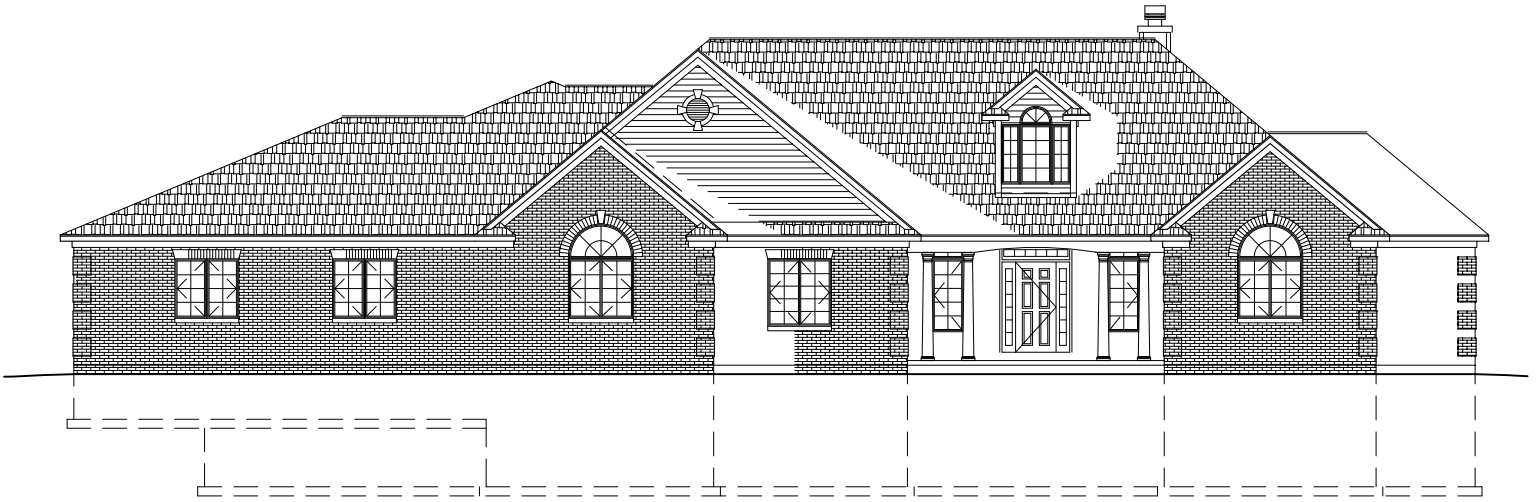
FRONT ELEVATION A-1